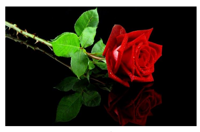
Join us for a