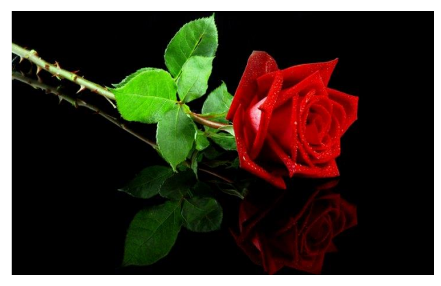
Join us for a