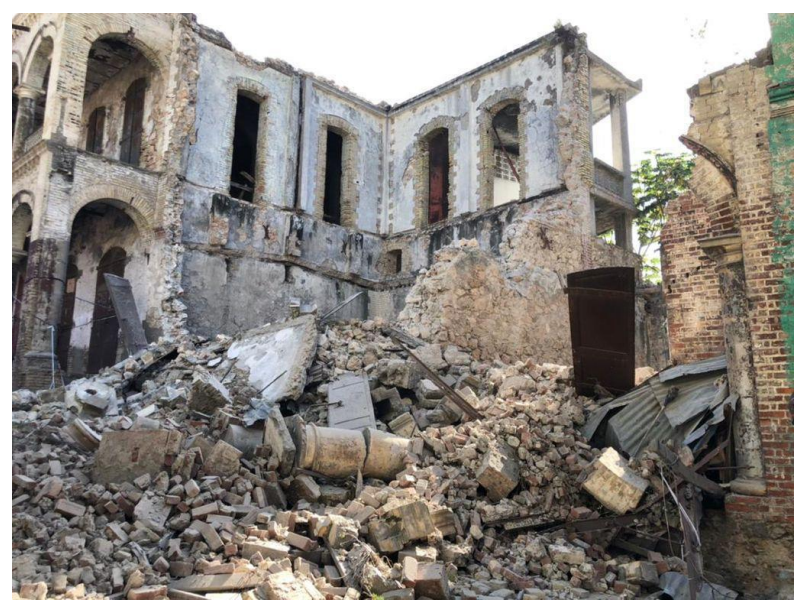
Building damaged by the earthquake in Haiti, August 2021.

On the morning of Saturday, August 14, Haiti was struck by a severe earthquake. The extent of the damage is still unclear. Haitians and the international community are working hard to rescue people trapped under the rubble. But the number of deaths has risen above 2000. Many homes and community buildings have been destroyed. Hospitals have also been damaged, and acutely injured and traumatized people are struggling to find help. And what's more, Tropical Storm Grace hit Haiti on August 16, making an already bad situation worse.