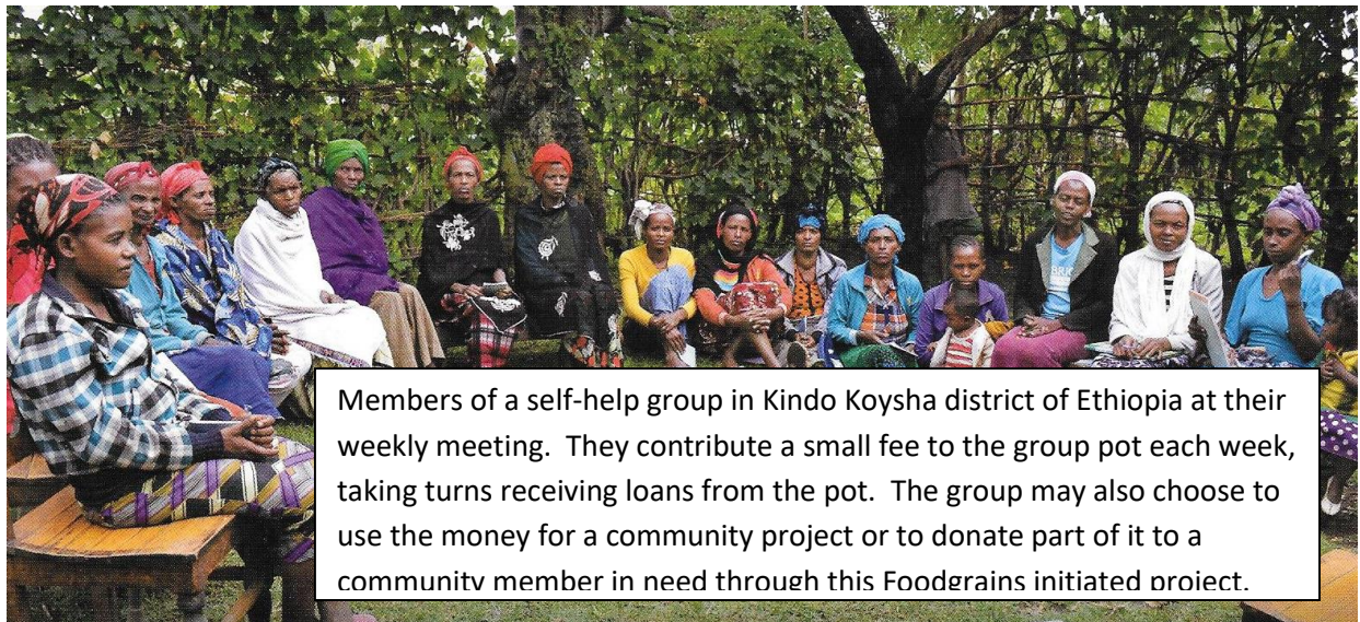
Members of a self-help group in Kindo Koysha district of Ethiopia at their weekly meeting. They contribute a small fee to the group pot each week, taking turns receiving loans from the pot. The group may also choose to use the money for a community project or to donate part of it to a community member in need through this Foodgrains initiated project.